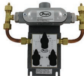
3-way valve assembly with integral bleed screws