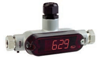
629 shown with optional Red LED and cable gland.