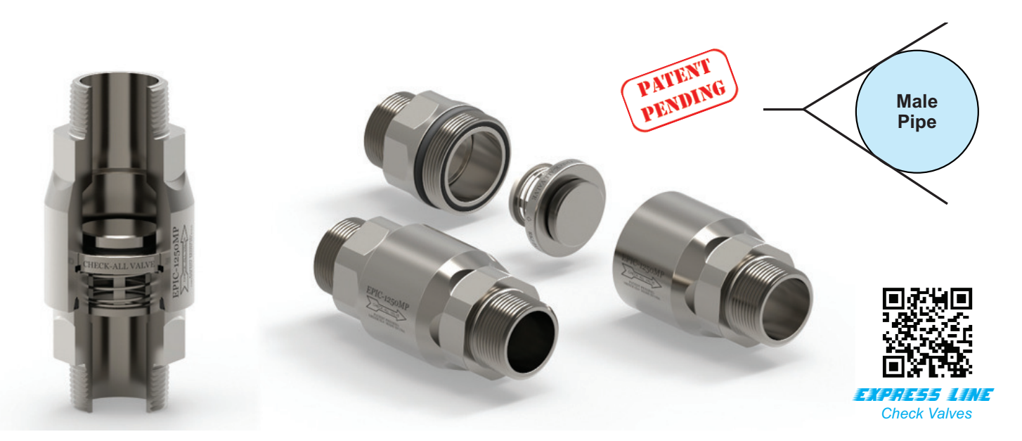
The EPIC <sup>TM</sup> Male Pipe valve is a poppet style check valve with male NPT threaded connections machined from 300 series stainless steel bar stock with Aflas<sup>®</sup> seat/seals and a 1/2-PSI stainless steel spring (cracking pressure) that can be installed in any flow orientation. This check valve achieves a high flow capacity and reduced pressure loss compared to other poppet style check valves of similar sized connections. Additionally, the EPIC <sup>TM</sup> series incorporates a replaceable drop-in check mechanism (Replaceable Insert Kit sold separately) that is easily installed into the existing body without requiring additional assembly of checking components.

Due to the materials of construction, high flow capacity, field repairability and the quality customers have come to expect from Check-All®, the EPIC^{\text{\tiny TM}} check valves are uniquely suited for a very wide range of applications in liquids, gases and steam.