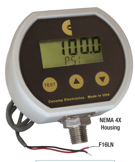
Quick Link: cecomp.com/loop