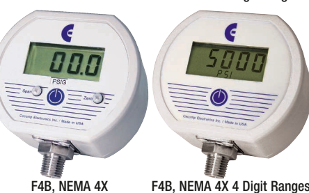
F4B, NEMA 4X 4 Digit Ranges