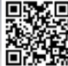
Compact Pressure Switch Series 96201, 96211, 96221