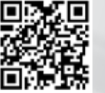
OEM Transducer Series 600

Contact your regional distributor today!