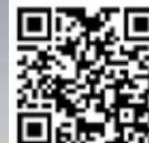
General Industrial Transducer (Amplified) Series 423, 425, 426