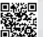
General Industrial J-Box Transducer Series 423N1, 425N1, 426N1