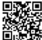
Visual Indicating Sealed Piston Switch Series C9612, C9622