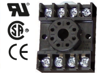
API 008 600 V Rating